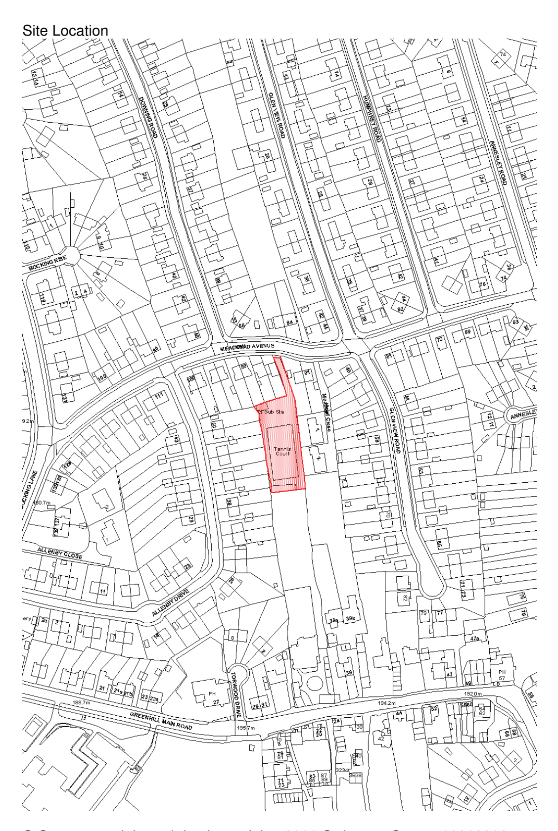
© Crown copyright and database rights 2011 Ordnance Survey 10018816